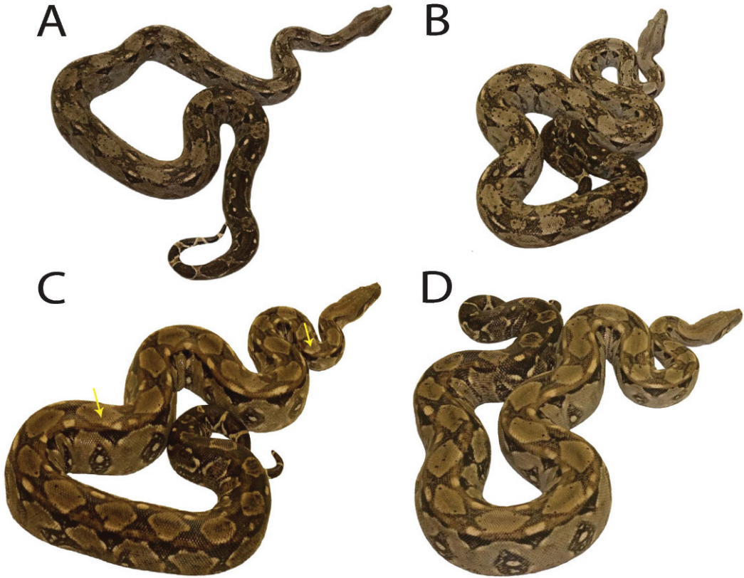
FIG. 1. Photographs showing color change within representative island (A, B) and mainland (C, D) boas ( Boa constrictor ) from Belize. Images on the left (A and C) were taken during the day, and the images on the right (B, D) are of the same two snakes taken during the night. Photos were taken immediately after removing snakes from their enclosures on 18 November 2003 using a Canon D300 digital camera with a Canon 22-55/f3.5-f4.5 lens under identical lighting conditions. Yellow arrows on snake C indicate locations where color measurements were taken: neck (between second and third dark dorsal blotches) and body (between 13th and 14th dark dorsal blotches). Note that the change in the island boa (A to B) appears greater relative to the change in the mainland boa (C to D) yet our data demonstrate that changes in brightness are similar between animals from the two environments.

ty of this red color varies across the species' range. The dorsal pattern (blotched-spotted category of Jackson et al., 1976) presumably serves to break up the snakes' outline, a feature that would be consistent with the idea that boas are primarily ambush predators (Greene, 1983). The color pattern is static throughout ontogeny with the exception that juvenile boas are usually more vivid (strongly contrasting pattern) than the adults, which tend to darken with age (Greene, 1983).